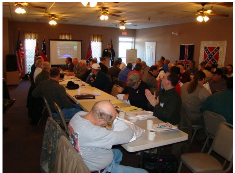
Visual proof there were good items in the goodie bag.