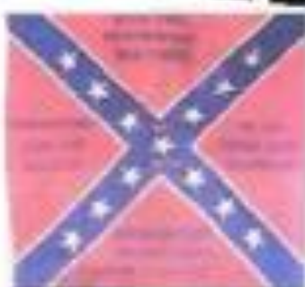
14th Tennessee Infantry

The Tennessee Division of the Sons of Confederate Veterans generously donates a portion of the tag sales to the Tennessee State Museum to be solely used for the museum's flag conservation program. If you do not have a SCV tag, you need to get one to help preserve your history.