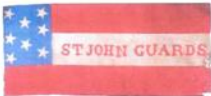
18th Tennessee Infantry Regiment