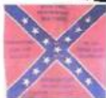
14th Tennessee Infantry

The Tennessee Division of the Sons of Confederate Veterans generously donates a portion of the tag sales to the Tennessee State Museum to be solely used for the museum's flag conservation program. If you do not have a SCV tag, you need to get one to help preserve your history.