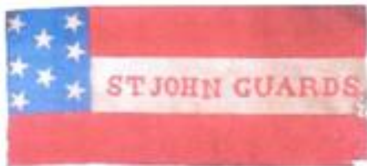
18th Tennessee Infantry Regiment