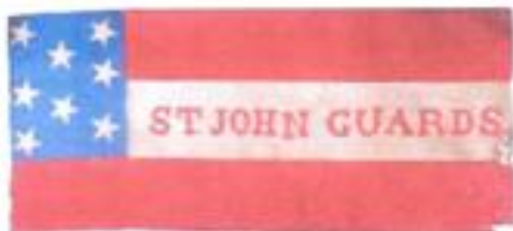
18th Tennessee Infantry Regiment