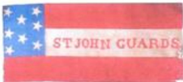
18th Tennessee Infantry Regiment