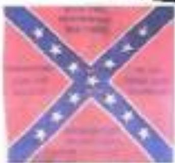
14th Tennessee Infantry

The Tennessee Division of the Sons of Confederate Veterans generously donates a portion of the tag sales to the Tennessee State Museum to be solely used for the museum's flag conservation program. If you do not have a SCV tag, you need to get one to help preserve your history.