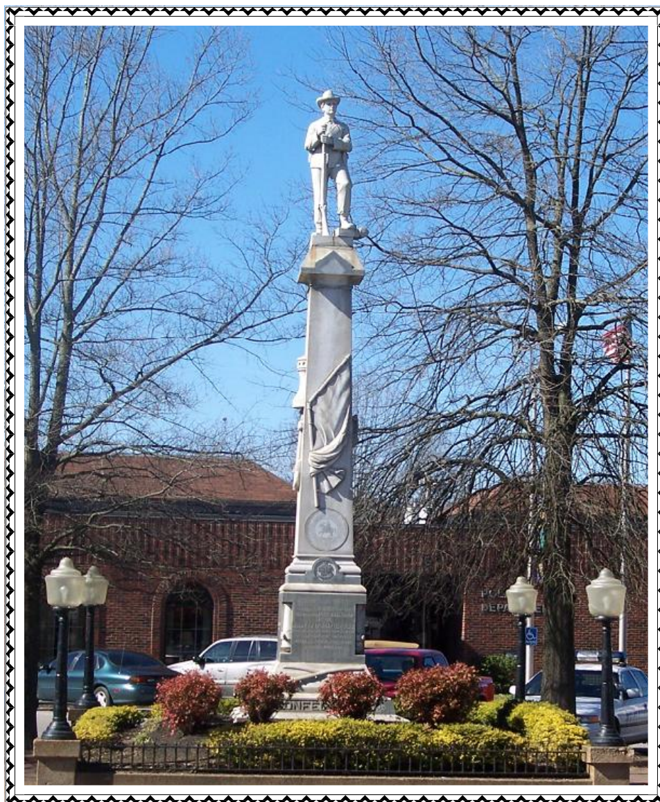
Bigby Grays Confederate Monument - Mount Pleasant, Tennessee

NEXT MEETING WILL BE HELD TUESDAY MAY 17TH AT 7PM!