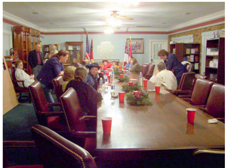
A couple of pictures from the AOT Christmas Party