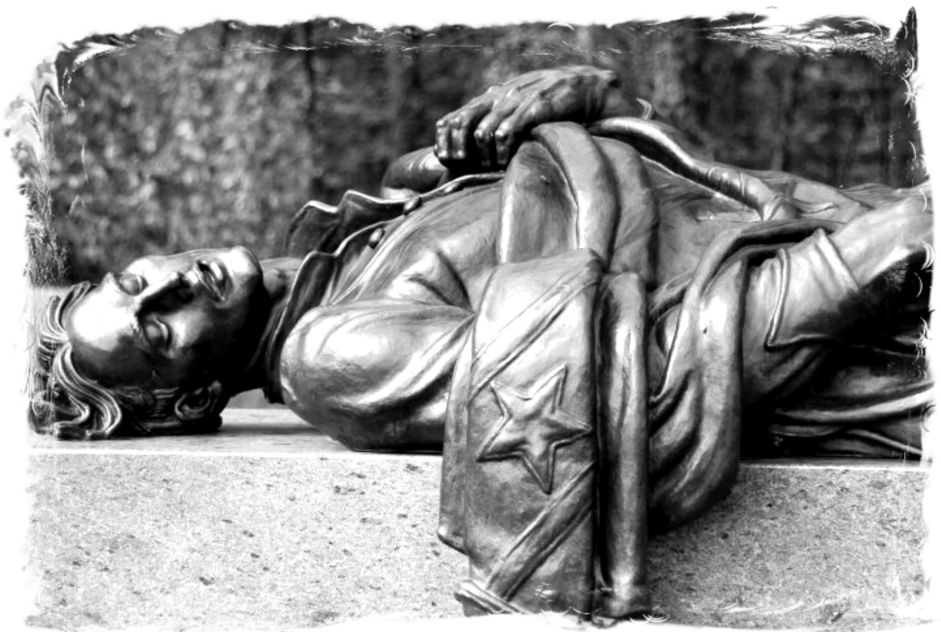
Louisiana Monument at Gettysburg

Official Organ Of The Samuel R. Watkins Camp #29 Sons of Confederate Veterans