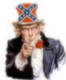
I WANT YOUR DUES

Everybody try to bring in at least one or two members this year. .