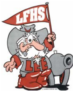
Lee Freshman High School Mascot