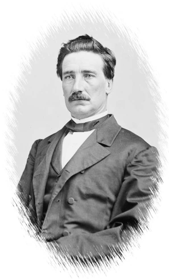
General John D. Imboden February 16, 1823 – August 15, 1895

Official Organ Of The Samuel R. Watkins Camp #29 Sons of Confederate Veterans