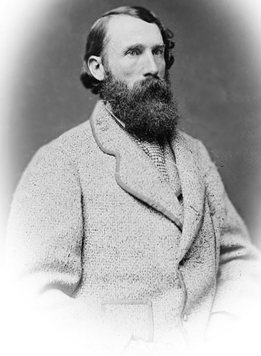
GENERAL AMBROSE POWELL HILL November 9, 1825 — April 2nd, 1865

Official Organ Of The Samuel R. Watkins Camp #29 Sons of Confederate Veterans