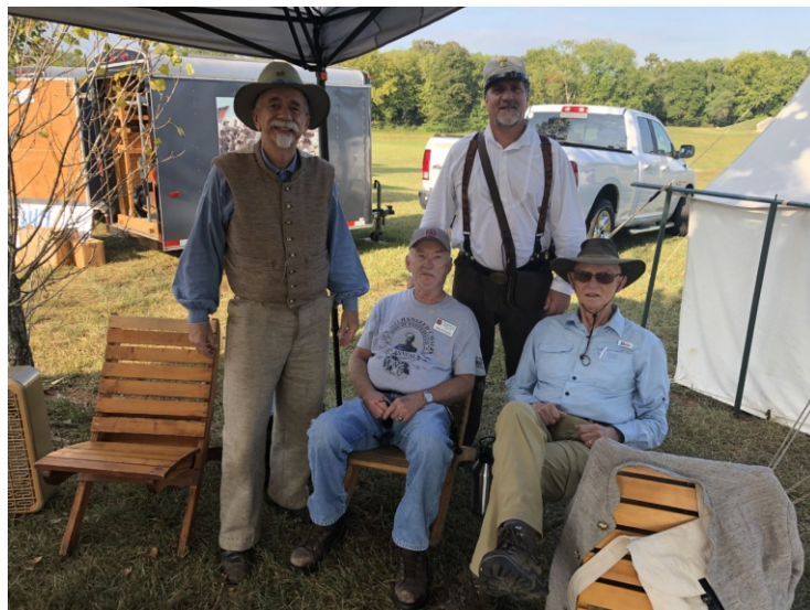
Members of Longstreet-Zollicoffer Camp 87, Sons of Confederate Veterans, were excited to participate at the Sequoyah Festival in Vonore in September.