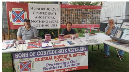
General Hatton Camp Booth at Wilson County Fair