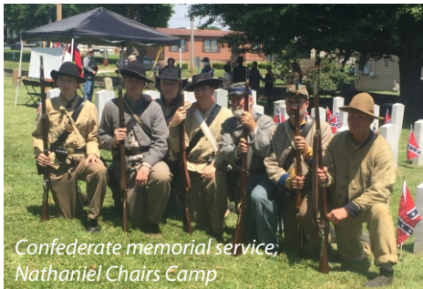
Confederate memorial service, Nathaniel Chairs Camp