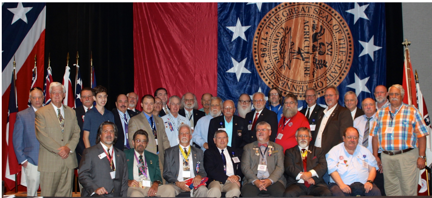
Tennessee Division delegation at the National reunion Franklin, TN, 7/21/18