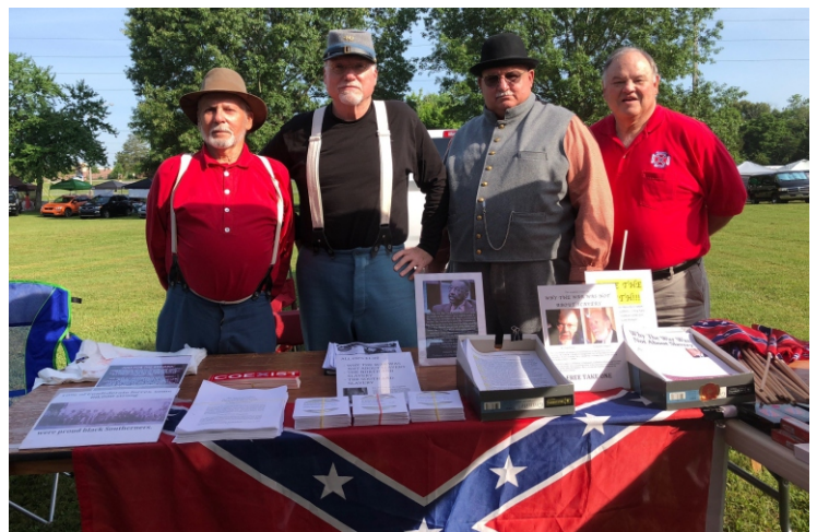
Members of Longstreet-Zollicoffer Camp 87, Sons of Confederate Veterans, were in attendance at the Secret City Festival in Oak Ridge.