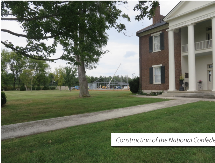
Construction of the National Confederate Museum at Elm Springs.