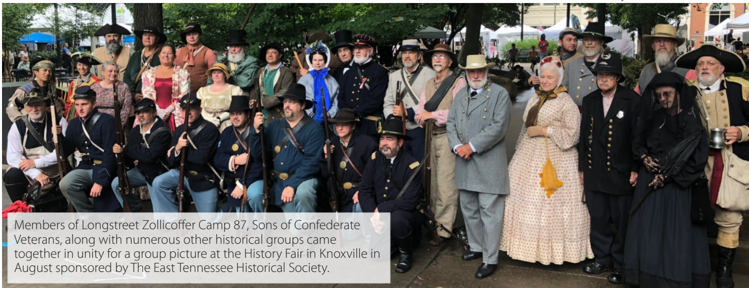
Members of Longstreet Zollicoffer Camp 87, Sons of Confederate Veterans, along with numerous other historical groups came together in unity for a group picture at the History Fair in Knoxville in August sponsored by The East Tennessee Historical Society.