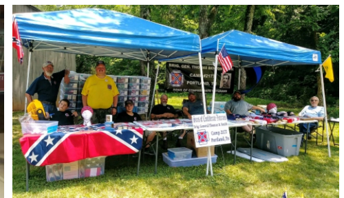
Portland camp at Nathan Bedford Forrest home