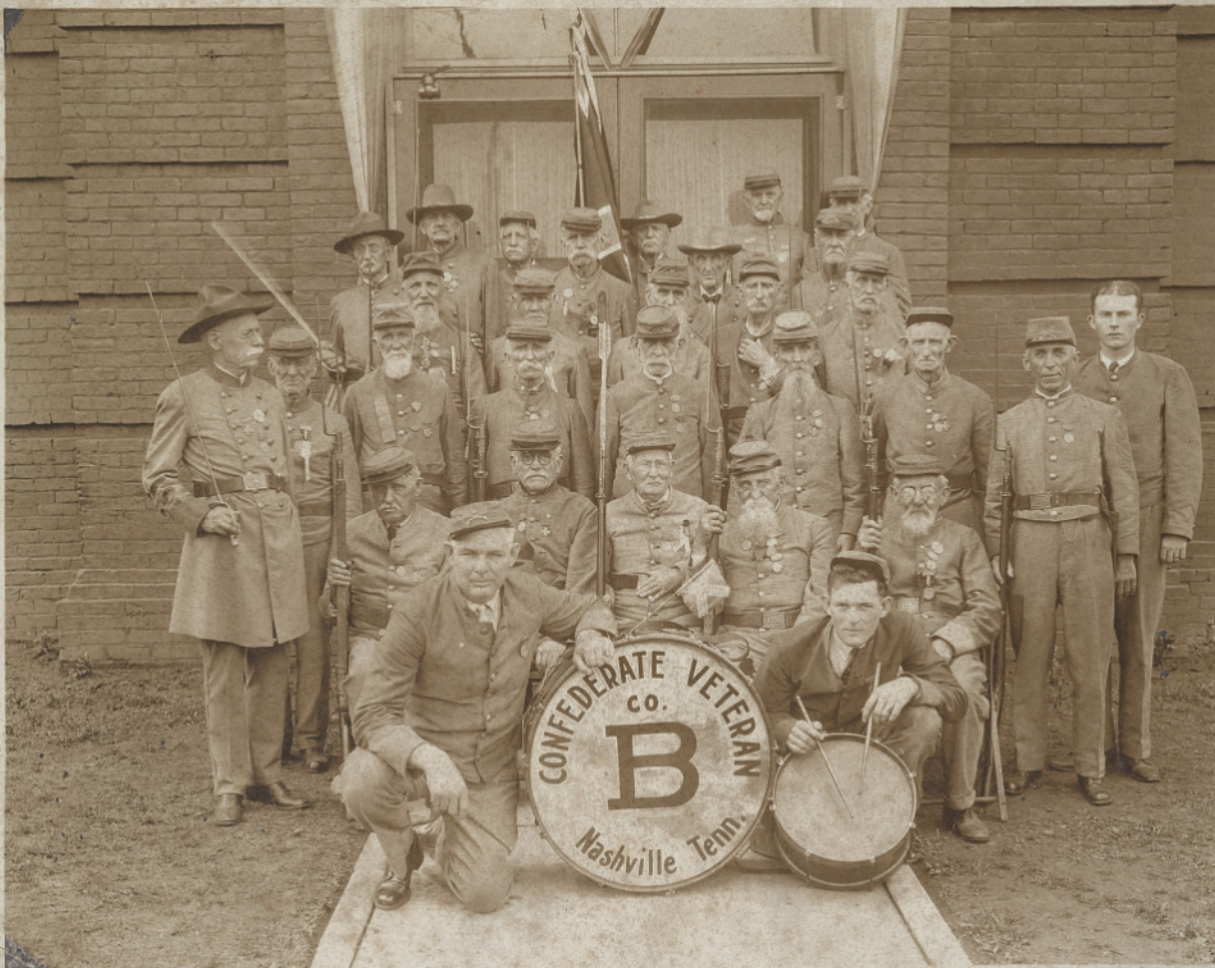
Company B, Confederate Veterans of Nashville, Tennessee at the Memphis Reunion in 1924