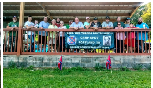
Camp2177 shrimp boil